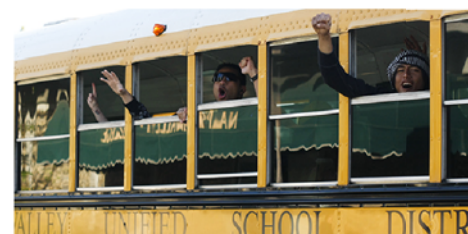
A bus load of NVC students and staff head out for Sacramento on Monday.