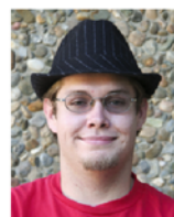
BY MATT RIOS

There are many books out there, almost too many. For some, it makes for a confusing atmosphere when shopping for a good read. It's hard to know what books are good. If you're like me you spend a good hour in the bookstore trying to find just the right book. Also, if you're like me you find yourself drawn mostly to the science-fiction and fantasy section more often than to classical literature. There's just